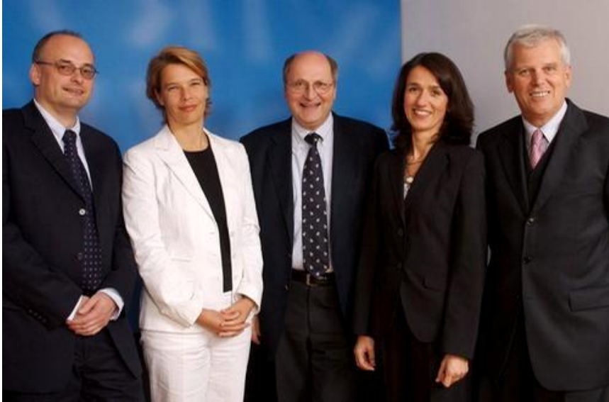
Rector's Council of WU

http://www.wu.ac.at/io (WU International Office)